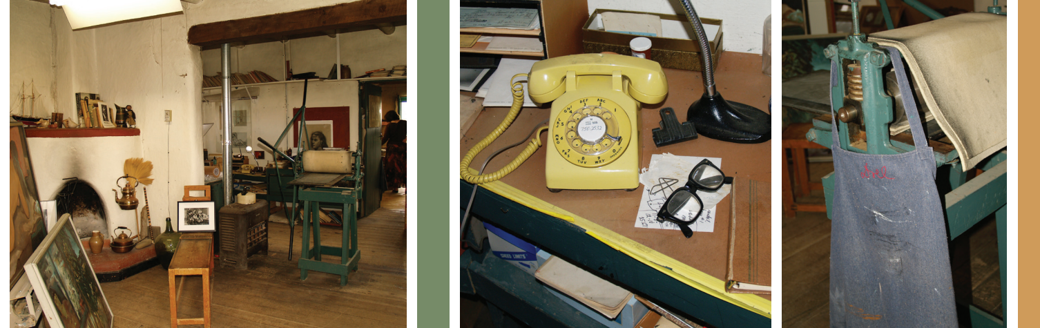
Photos from Doel Reed's Studio, before the renovation, which will be completed this summer.